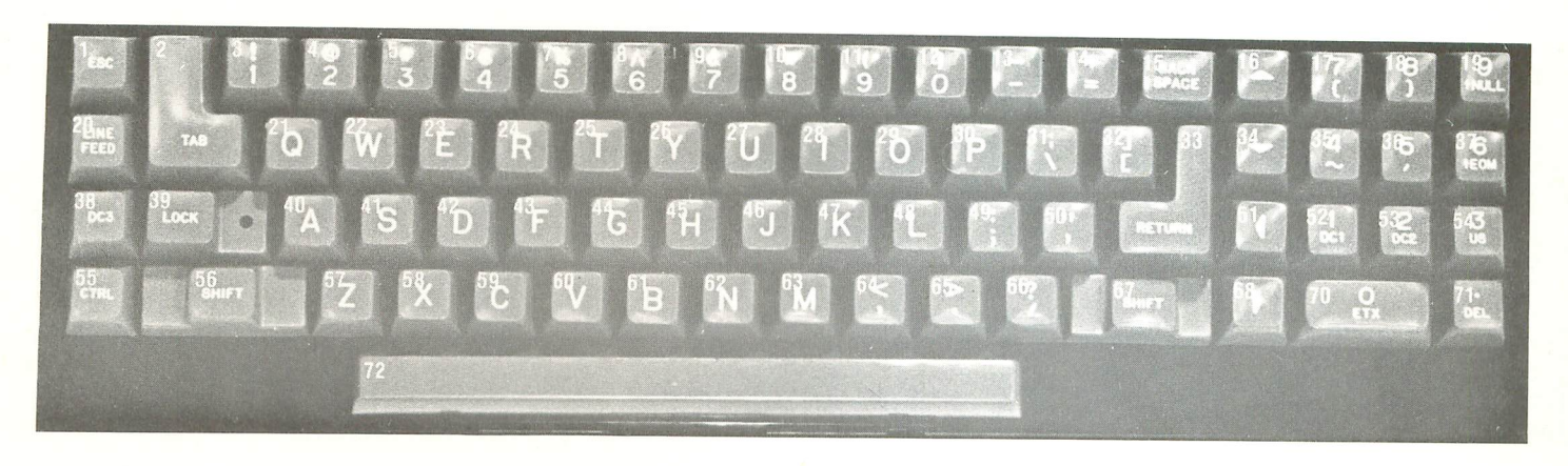
Figure 2 8532-2 Keyboard Layout

Shifted. The Numeric key pad on the right of the keyboard layout is active only in the shifted mode. Unshifted, it is a cluster of lesser used characters and control keys useful for word processing systems. The cursor arrows, Return, Backspace, Tab, Escape, Line feed, DC3, and Space transmit the same code in all four shift/control states. In all cases, a full 8 bit character code is transmitted. In the Control-Shift state, the Numeric key pad transmits upper codes (above octal 177), with bits 0 thru 6 containing the codes for the digits, and bit 7 set on.